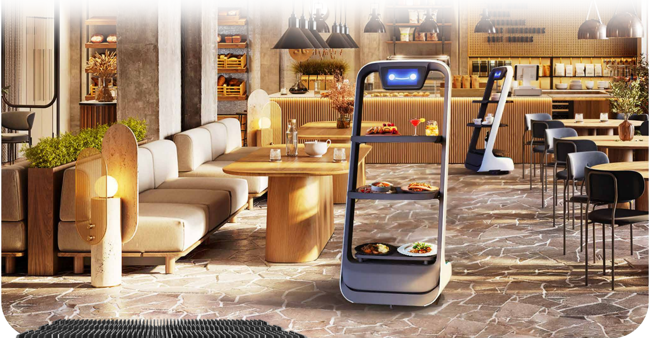
^ Robot Waiter

Workstation-grade Expandable Fanless Embedded System