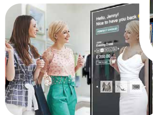
v Smart Retail